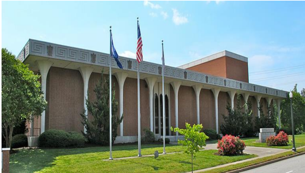
The present Scottish Rite Temple (c.2010)