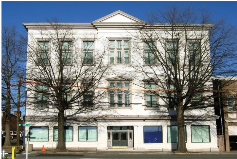
St. Albans Hall (c.1982)

John L. Roper Lodge of Perfection No. 5 was instituted in Richmond on December 20 at St. Albans Hall, also known as The Crenshaw Building, an historic Masonic Lodge located at 300 East Main Street, in downtown Richmond. It was built in 1869, by Metropolitan Lodge No.11 and Joppa Lodge No.40, and was a three-story, stuccoed brick Italianate style building. The Hall consisted of shops, a concert hall, as well as Masonic Lodge meeting rooms on the third floor, and served as an important focus of post-American Civil War Richmond's social and political life. It was listed on the National Register of Historic Places in 1982. No written records of the meetings appear to have been kept prior to the first recorded minutes of December 30.