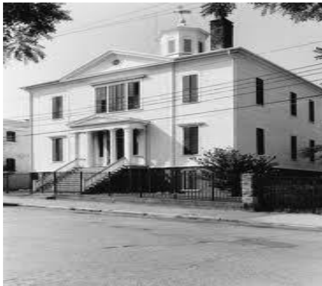
Masons Hall (c.1882)

John L. Roper Lodge of Perfection No. 5 was instituted in Richmond on December 20 at St. Albans Hall, also known as The Crenshaw Building, an historic Masonic Lodge located at 300 East Main Street, in downtown Richmond. It was built in 1869, by Metropolitan Lodge No.11 and Joppa Lodge No.40, and was a three-story, stuccoed brick Italianate style building. The Hall consisted of shops, a concert hall, as well as Masonic Lodge meeting rooms on the third floor, and served as an important focus of post-American Civil War Richmond's social and political life. It was listed on the National Register of Historic Places in 1982. No written records of the meetings appear to have been kept prior to the first recorded minutes of December 30.