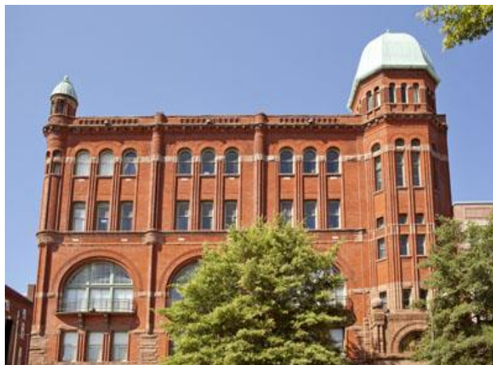
Masonic Temple (c.1959)

1900 – A second revival of the Scottish Rite began in Virginia.